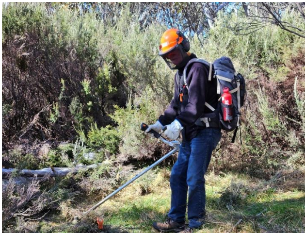
Clearing the walking track on Duane Spur

using brush-cutters, hedge trimmers and a chainsaw. There was a large log jammed against the chain spanning Big River, which was cleared with some ingenuity: the chain had to be cut, the log sawn, then the chain re-joined.