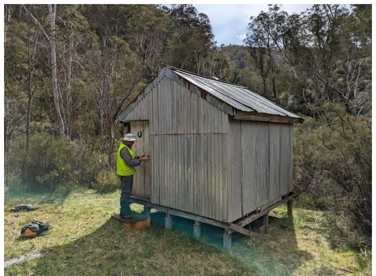
Rarely visited Cairn Creek Hut

The 2.5 km track goes to an old hut built to facilitate surveying the height of Big River where it is joined by Cairn Creek. The track has been very difficult to walk for some years, being lost among fallen timber and overgrown by bush. Parks Victoria rangers had made a number of previous attempts to clear the track but the huge amount of work involved and the difficulty of